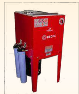
S10A shown with Optional 5 Gal Container