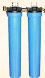
Dual Stage Cartridge System

Single Stage Filter System including 75 Micron Filter Module to help provide a more productive system.