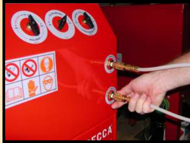
S300A w/ TURBO

Pressure Pot & Fluid Lines can be easily connected to the Turbo System utilizing your operations standard Fluid Quick Disconnects (not supplied)