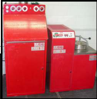
New Application of BECCA Protect™