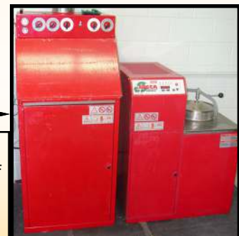
New Application of BECCA Protect™