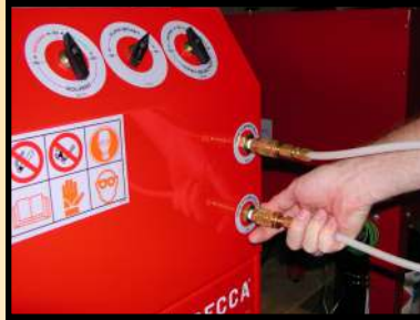
S300A w/ TURBO

Pressure Pot & Fluid Lines can be easily connected to the Turbo System utilizing your operations standard Fluid Quick Disconnects (not supplied)