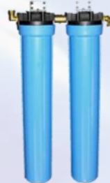
Dual Cartridge System

The ENVIRO E300A, E700M & E800A have a two stage Filter System including a 75 Micron and a 25 Micron Filter providing the best overall paint residue control.