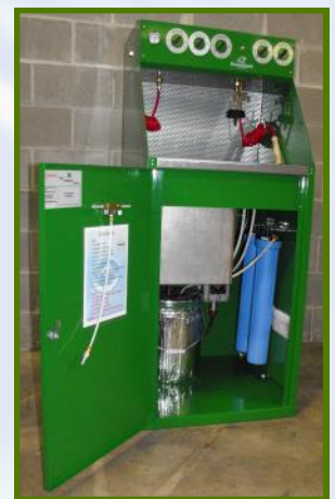
Dual Cartridge System Shown on E800A