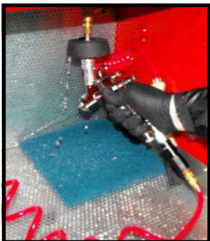
POWERPISTOL™ - Pulsating Fluid... Powerful Cleaning for the Fluid Passageways