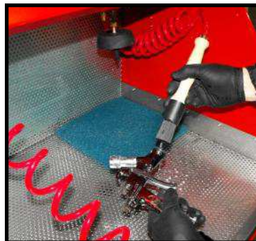
STAINLESS WORKSTATION ..... A Spacious Work Area for Easy Use