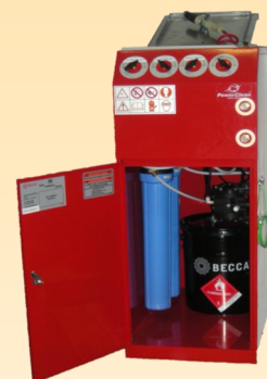
S300A shown with Optional 5 Gal Container