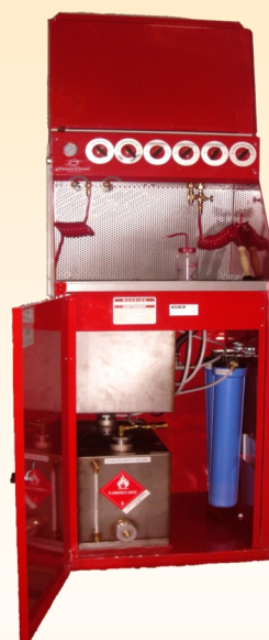
S800A Shown w/ Optional TURBO Pressure Pot & Fluid Line Cleaner, 10 Gal Tank & Cover Door