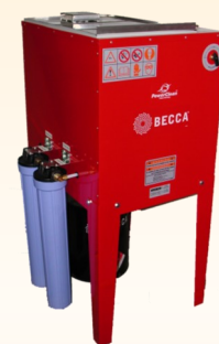
S10A shown with Optional 5 Gal Container